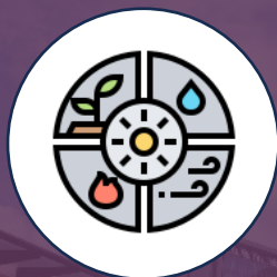
Resource management (water, energy and paper)