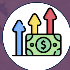
Compliance with Financial Goals