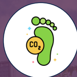
Carbon Footprint Management