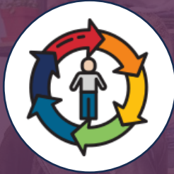
Human Talent Management