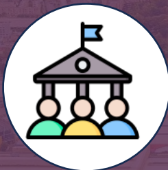
Ethics and Transparency Guiding Pillar