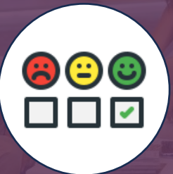
Visitor and exhibitor satisfaction

We promote local and national culture through our fairs, events and our media